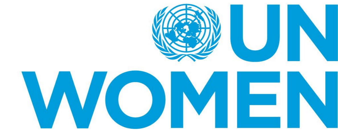
UN Women, Europe & Central Asia