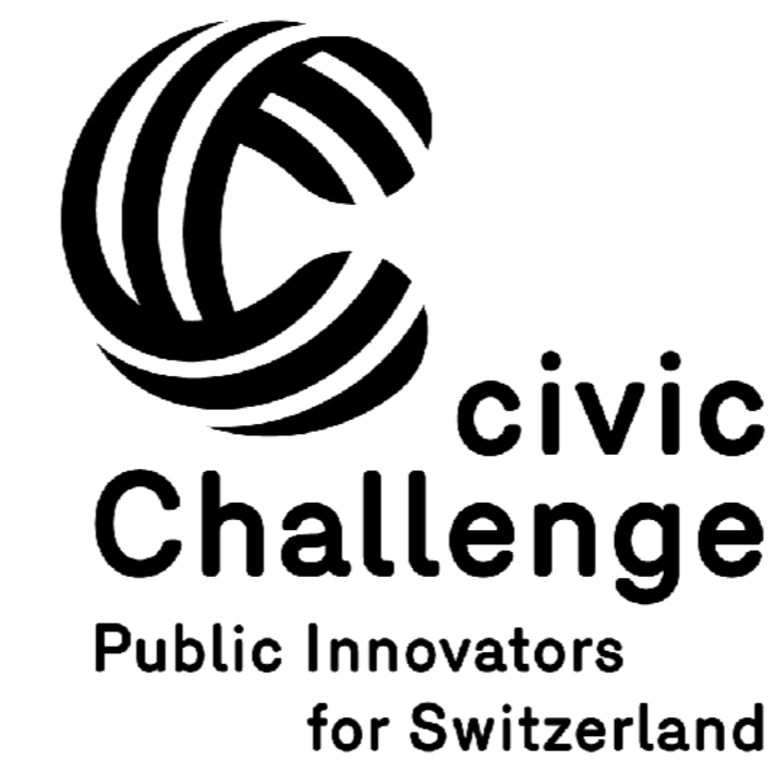
Civic Challenge, Switzerland