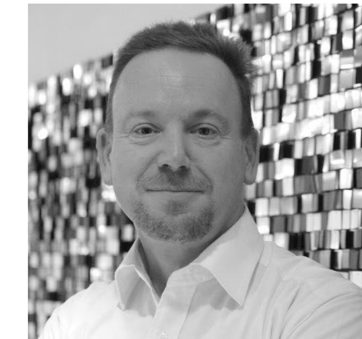
Geoff Mulgan UCL