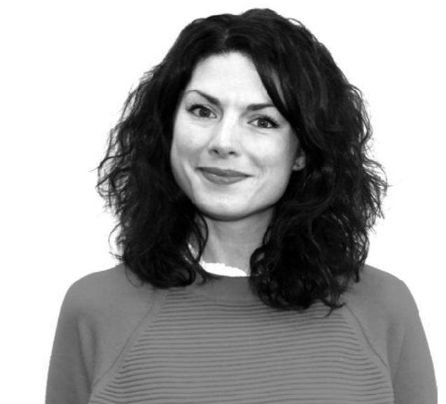
Cat Drew Design Council